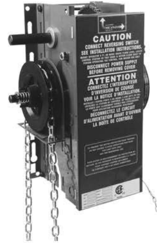
Commercial limited duty belt drive jackshaft operator with emergency chain hoist