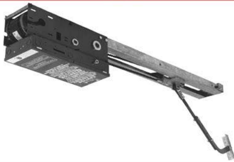
Limited duty belt drive trolley operator for standard lift sectional doors.