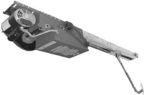
Industrial, continuous duty belt drive trolley operator for standard lift sectional and sliding doors