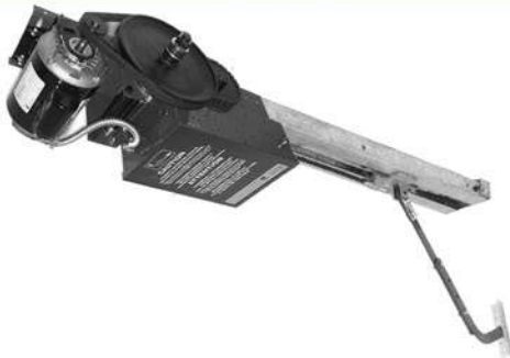
Industrial, continuous duty belt drive trolley operator for standard lift sectional doors.