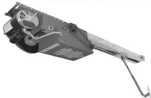
Industrial, continuous duty belt drive trolley operator for standard lift sectional and sliding doors