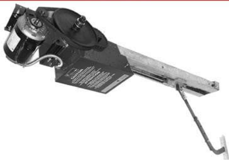
Industrial, continuous duty belt drive trolley operator for standard lift sectional doors.