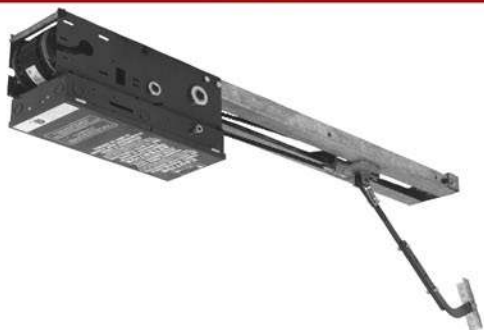
Limited duty belt drive trolley operator for standard lift sectional doors.