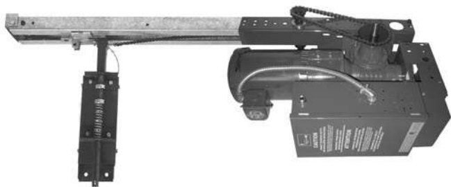
Industrial, continuous duty worm gear trolley operator for large standard lift sectional and sliding doors